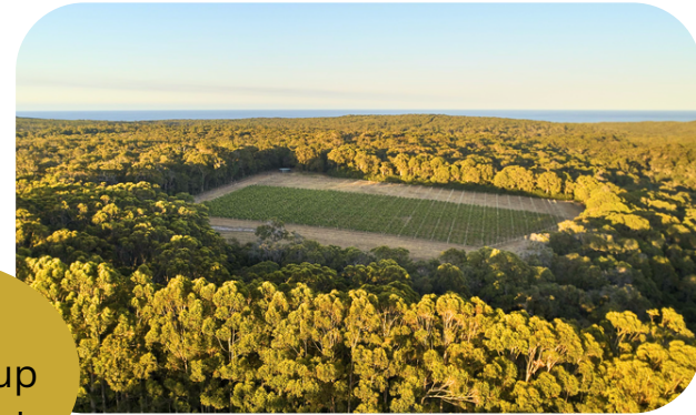
The Calgardup Vineyard