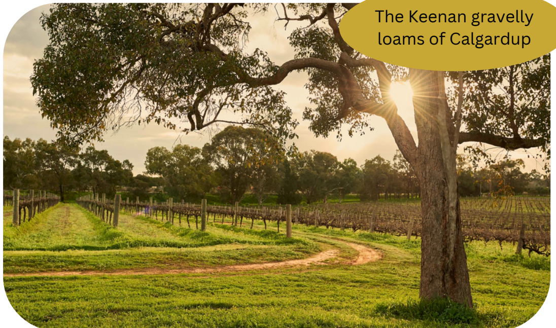
The Keenan gravelly loams of Calgardup